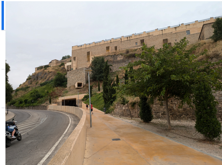
The Safont's climb up