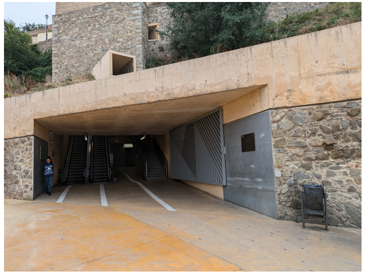
Remonte de Safont-- The Safont's climb up