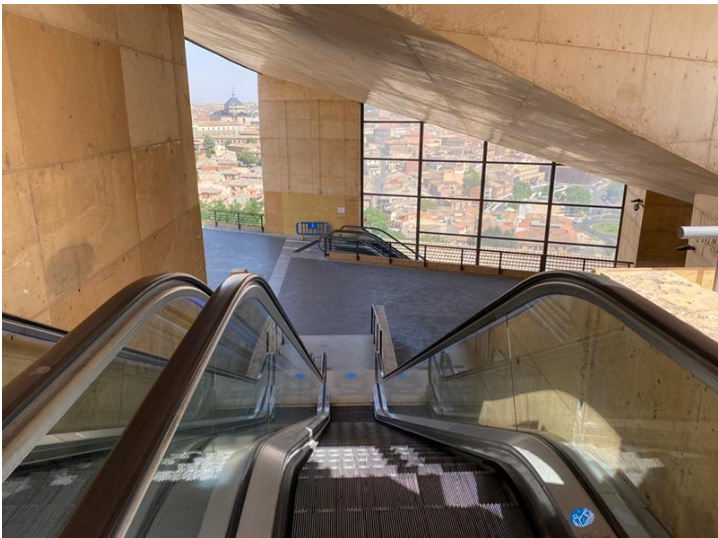
Safont's entrance (near the window at front)