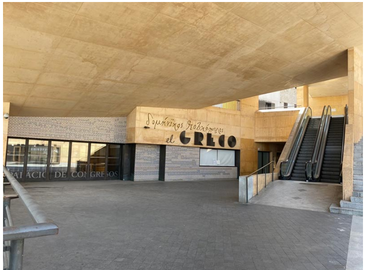
Toledo's Palace of Congress (venue place). (Left) Safont' stairs